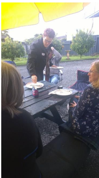
Committee members and other members discussing various subjects.

Thank you for everyone that attended, it was wonderful to see a great turn out. We hope to have more social occasions like this in the near future.